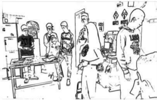
Micro-theatre performance for students in the school (Cruz, 2017)