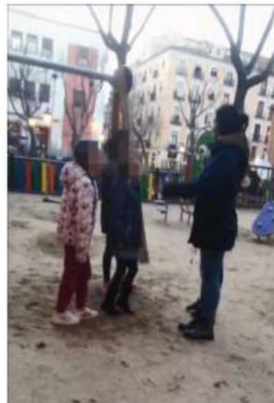
Screen-capture from children's video (Gallego, 2018)