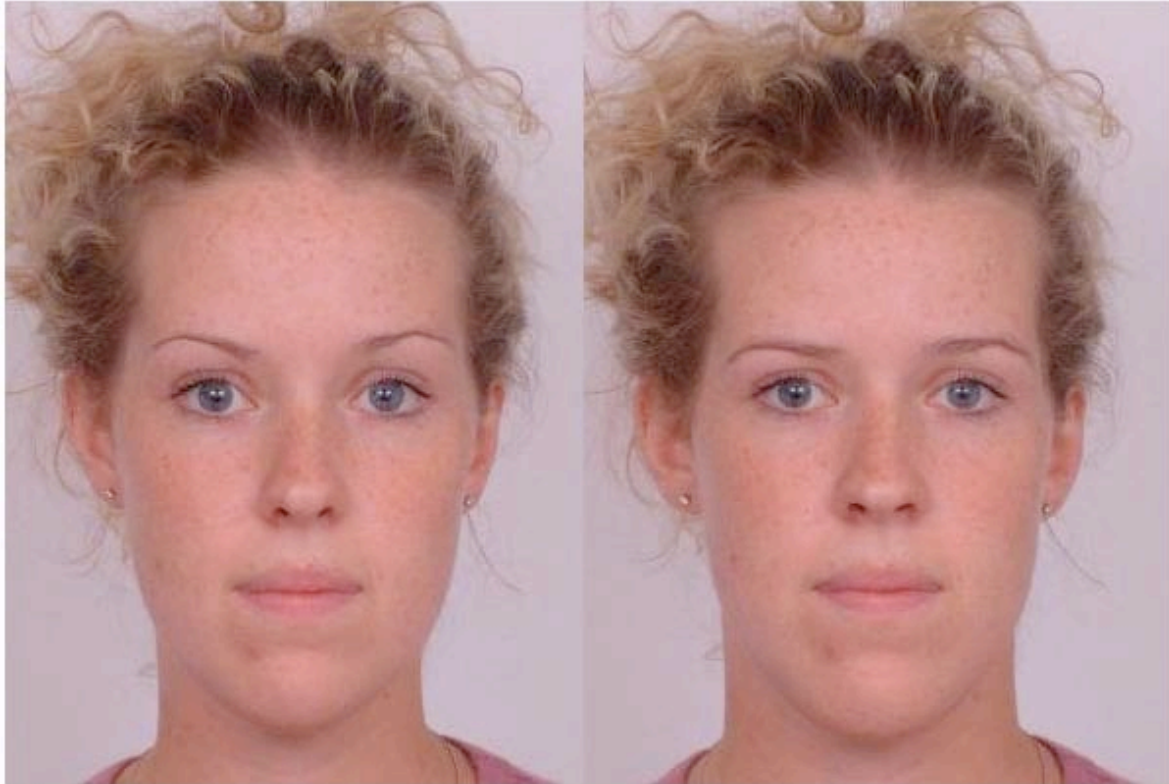
Figure 1. Examples of feminized (left) and masculinized (right) versions of a female face.

studies using these stimuli have demonstrated that the masculinized versions are perceived as more masculine than the feminized versions (e.g., Welling et al., 2007, 2008), confirming that manipulating masculinity using these methods affects perceptions of masculinity in the intended manner. The face stimuli used in the current research have been used in several previous studies (e.g., Jones et al., 2007; Welling et al., 2007, 2008).