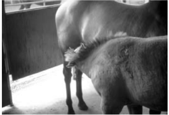
Young foals nurse up to 70 times daily, indicating that they are well suited to small meals.

Before purchasing alfalfa hay, horse owners should ask hay producers whether steps were taken to avoid blister beetles. Blister beetles can be found in other hays, but they are found more often in alfalfa than in other roughage sources.