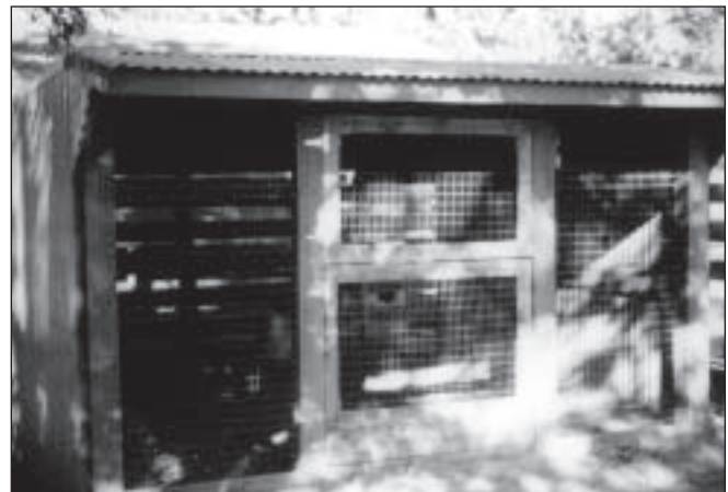
A typical building used for growing broilers or roasters for a youth project.

Be prepared for the chicks 2 days in advance. Put at least 4 inches of litter on the floor of the cleaned, disinfected house. Wood shavings, cane fiber, coarse