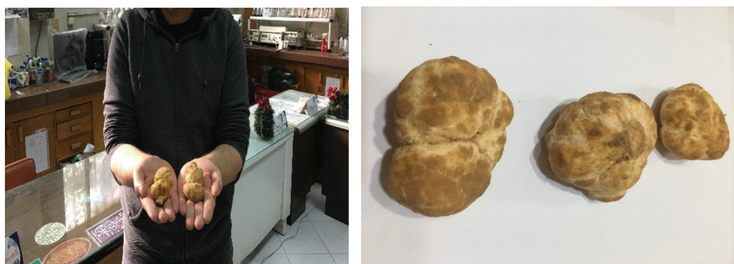
Truffles Ex. Tirmania spp.