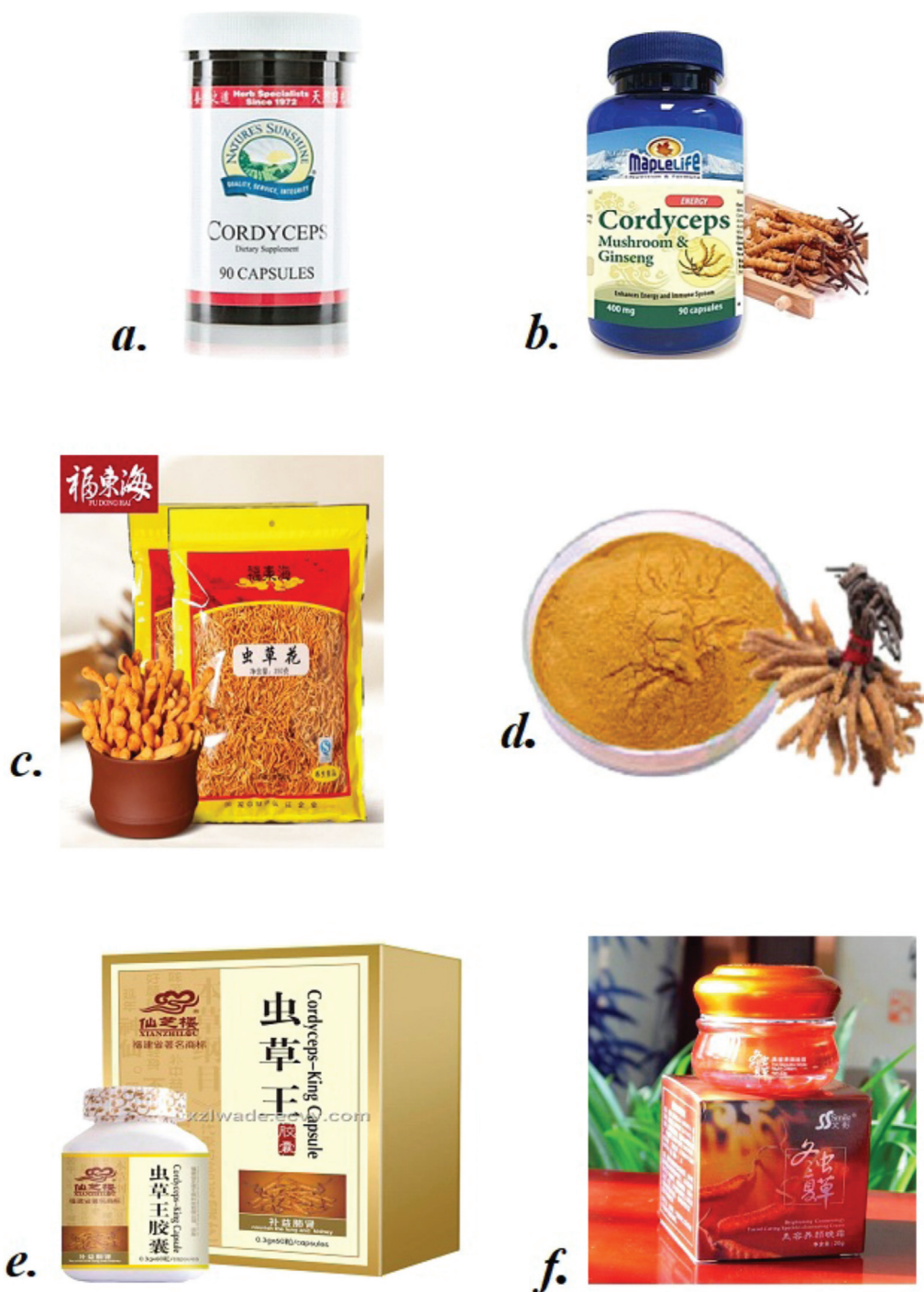
Cordyceps products made in China: (a) Cordyceps sinensis powder capsule ( www.naturessunshine.com ), (b) C. sinensis powder capsule ( www.alibaba.com ), (c) C. militaris soup ( www.aliexpress.com ), (d) Cordyceps mycelia extract powder as food supplements ( www.alibaba.com ), (e) Cordyceps-king capsule ( www.ecvv.com ), (f) C. sinensis cream ( www.aliexpress.com ).

the presence of cordycerebroside A, soyacerebroside I, and glucocerebroside, which prevented the accumulation of the pro-inflammatory iNOS protein [125].