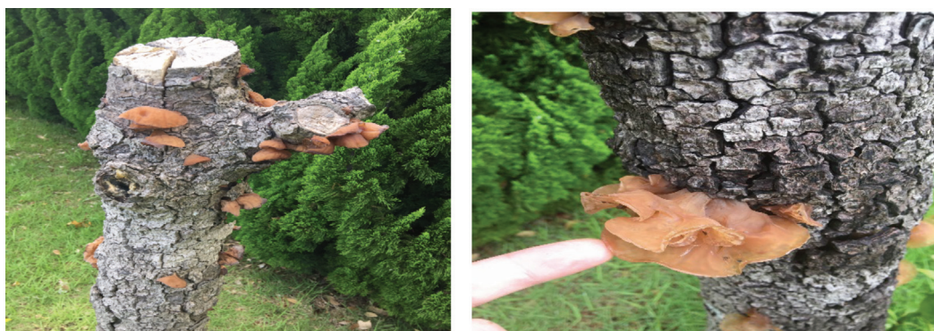
Jelly mushroom Auricularia spp.