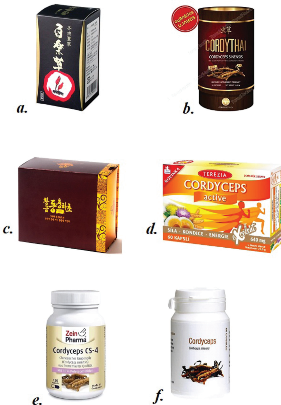
Cordyceps products made in different Asian and European countries: (a) Cordyceps sinensis supplement capsules made in Japan ( https://cordyceps.tokyo ), (b) C. sinensis supplement capsules made in Thai ( www.amazon.com ), (c) Cordyceps tea sachets made in South Korea ( www.alibaba.com ), (d) Cordyceps powder capsules made in Czech ( www.terezia.eu ), (e) C. sinensis capsules made in Germany ( www.zeinpharma.com ), (f) C. sinensis capsules made in the UK ( www.healthy.co.uk ).

derived from these fungi all over the world as shown in Figs 7–9.