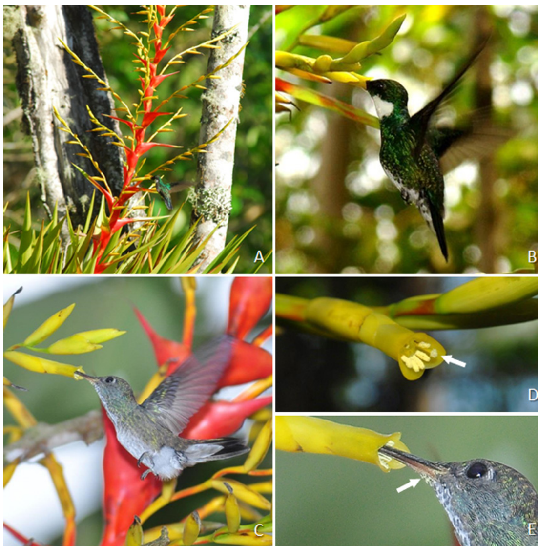
Figure 1. Plant, flowers, and hummingbird pollinators of Vriesea altodaserrae : A. view of plant and inflorescence visited by Leucochloris albicollis ; B. Leucochloris albicollis probing for nectar at a flower; C. Female Thalurania glaucopis visiting flower; D. corolla with stigma (arrow) sided by anthers; E. detail of T. glaucopis visiting flower and the local where pollen is deposited on the base of its bill (arrow).

and 2014. Observations were made directly or with aid of video cameras, totalizing 90h40min. Flower visitors which contacted anthers and stigma during visitation were considered pollinators. The relative frequency of each pollinator species was calculated by dividing the number of visits of each species by the total number of legitimate visits observed for all pollinator species. To characterize hummingbird foraging activity pattern along the day, we calculated the mean number of visits per plant per day for the periods 07h00min-10h00min, 10h01min-13h00min, 13h00min-16h00min and 16h00min-19h00min. Finally, in order to analyse the morphological match between distinct hummingbird species visiting V. altodaserrae and corolla tube of this plant, we measured the length of the corolla tube of 23 individual plants (one flower per plant) and compared to the measures of bill-plus-tongue taken from Vizentin-Bugoni et al. (2014).