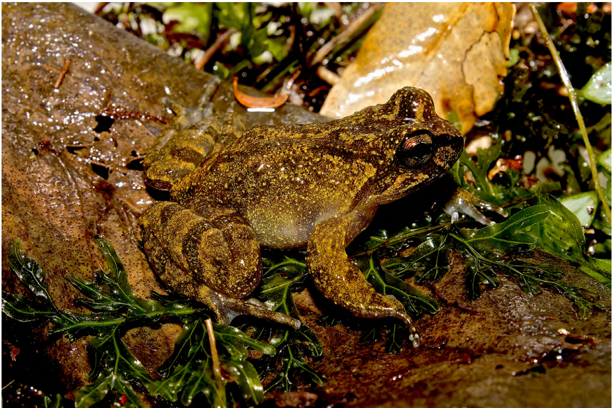
Figure 2. An adult male Insuetophrynus acarpicus from Llancahue.

narrow distribution, and aquatic habitat specialization.