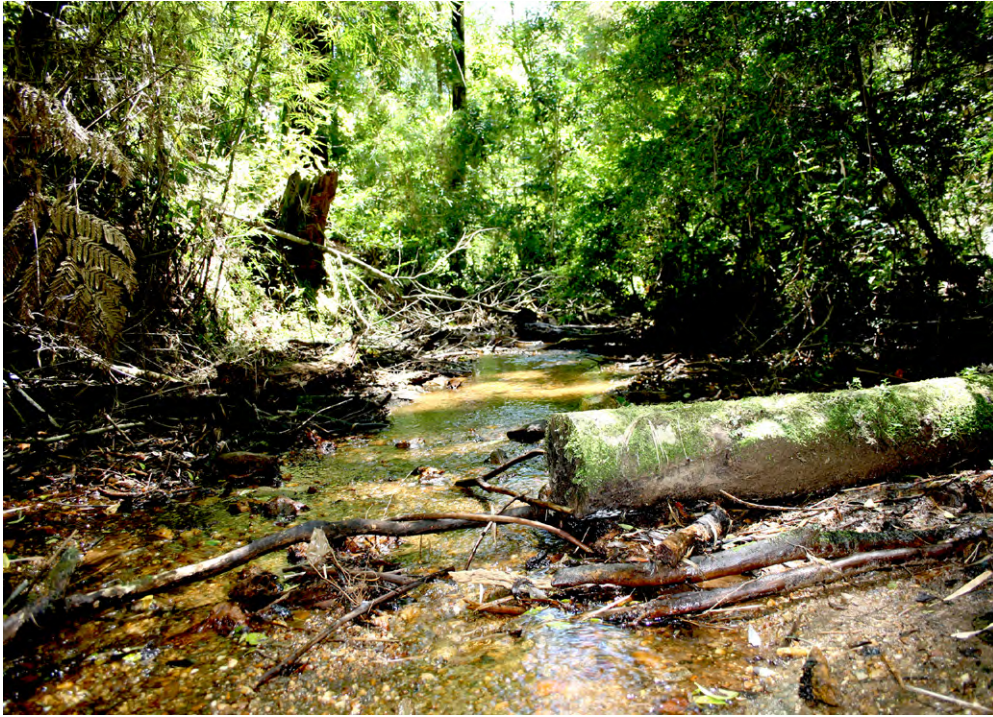
Figure 3. The habitat of Insuetophrynus acarpicus in Llancahue.