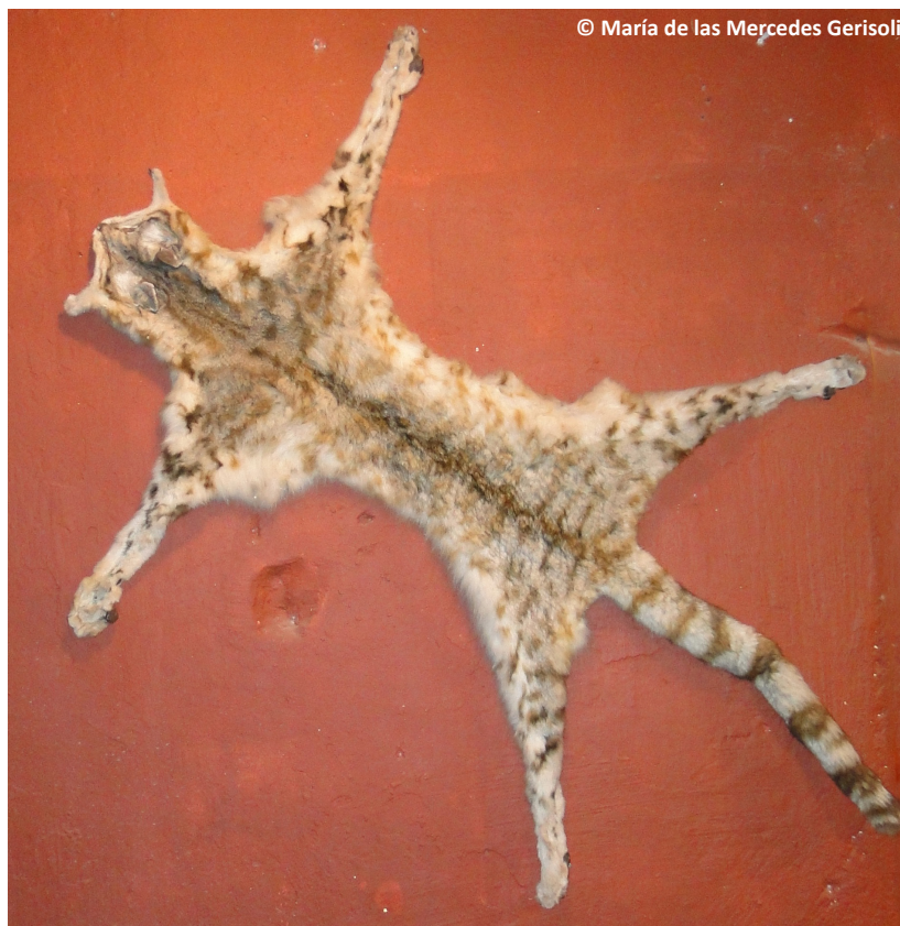
Image 1. Pelt of the Andean Cat individual poached in Las Cuevas, La Rioja Province, Argentina.

Genetic diversity across the currently known distribution has been studied. The Andean Cat populations have low genetic diversity, and two evolutionarily significant units (ESU) have been suggested for Argentina (Cossíos et al. 2012). The two ESU are separated by a large gap in the distribution range between 26°S and 35°S, which corresponds to the mentioned area with suitable habitat, but no records in La Rioja province. Genetic information was not obtained from the only sample collected in San Juan province.