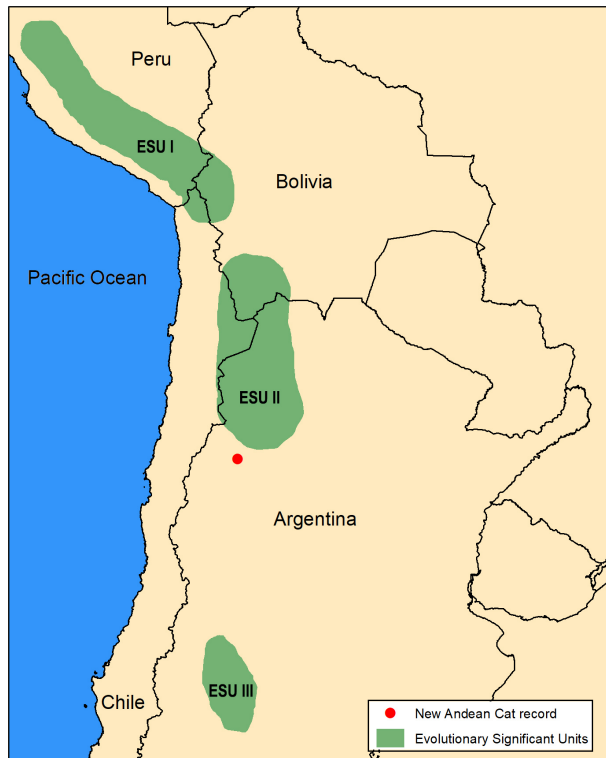
Figure 1. The reported Andean Cat record (red dot) and the currently identified evolutionarily significant units for Andean Cat (green areas). Adapted from Cossíos et al. (2012).

(Patagonian steppe) 80km east of the Andes (Sorli et al. 2006; Novaro et al. 2010). This last record at 650m updated the known elevation range for the Andean Cat, which was until then thought to be above 3,500m (Lucherini & Vidal 2003). We have gained a more complete understanding of Andean Cat distribution, but some questions remain unanswered. Particularly in Argentina, there is a large region in the province of La Rioja where no records have been found, and despite sampling efforts in the neighbouring province of San Juan, only one record was found; these provinces provide a large amount of suitable habitat for Andean Cats (Marino et al. 2011).