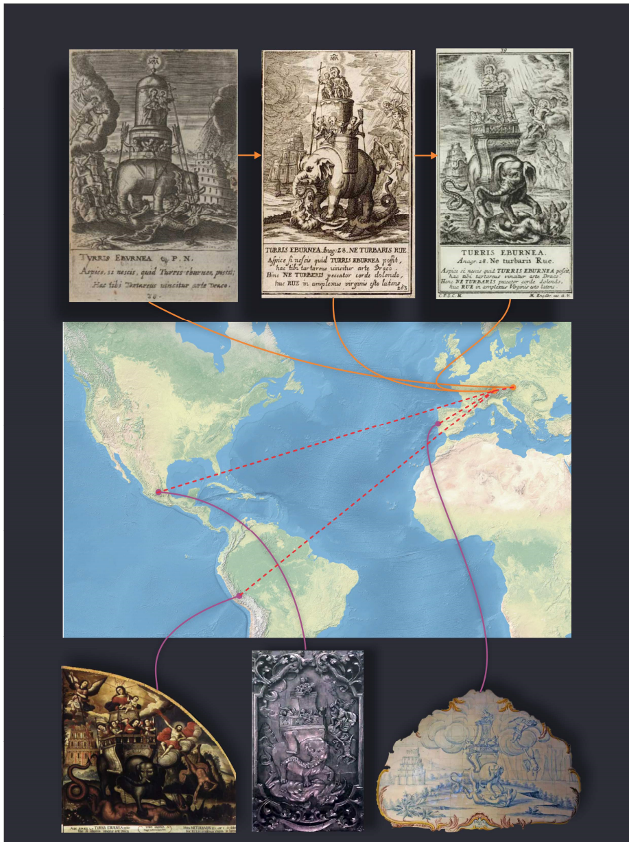
Fig. 1: Conceptual scheme showing one emblem ( Turrus Eburnea ), its cultural transmission and remediation (i.e. its transition from print to other supports: painting, sculpture and tile painting).