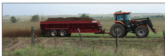
Composted manure can be applied using a tractor and spreader.

A pplying organic materials to your land can add beneficial nitrogen (N), phosphorous (P), potassium (K), micronutrients and organic matter to your soil. Organic materials can increase the soil's water-holding capacity, improve aeration, decrease erosion, and promote biological activity in the soil. Organic fertilizers can be very beneficial to pastures, crops and lawns, but they can contaminate surface and groundwater supplies if applied excessively or improperly.