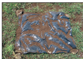
Apply organic fertilizer to the bag or tarp and then collect and weigh the material.

With the area and weight collected from each sample, you can calculate your actual application rate (AAR) and determine whether it corresponds to your desired application rate. Remember that if application rates are to be made on a dry-weight basis, the tons per acre (wet basis) should be divided by the percent moisture content (MC; decimal fraction) to get the correct application rate. The example below demonstrates how to determine your actual application rate.