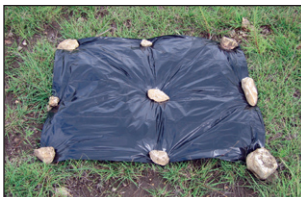
Use a plastic bag or tarp to verify organic fertilization rate.