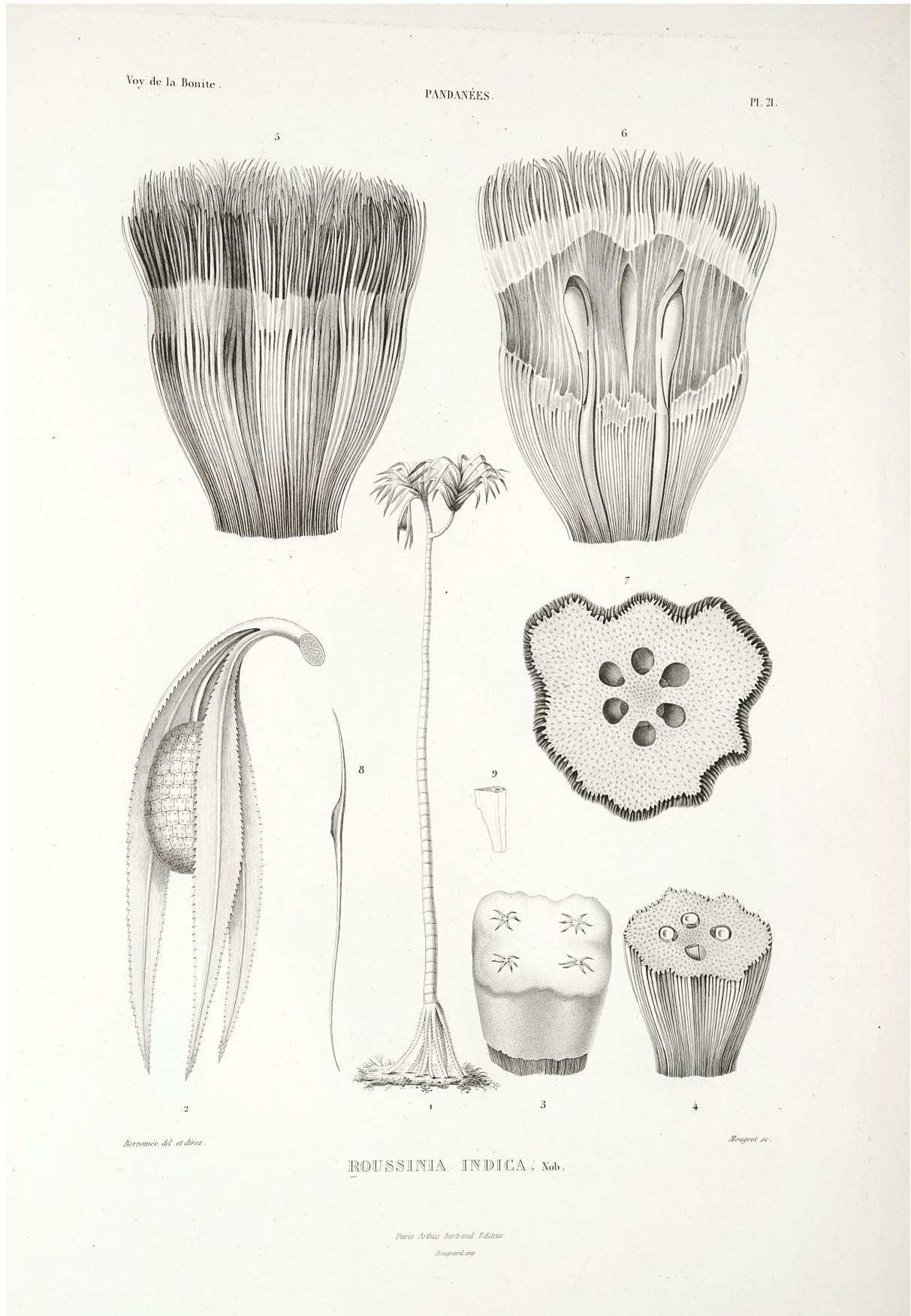
Fig. 5. Lectotype of Roussinia indica ( \equiv Pandanus indicus ): copper engraving in Gaudichaud-Beaupré, Voy. Bonite, Bot. 3: t. 21, fig. 1–4 . 1841 (only the parts numbered 1–4).