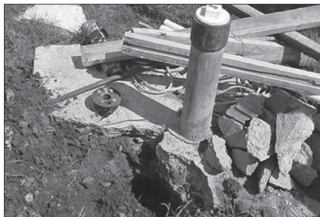
Figure 1. The slab around this capped well must be repaired to keep water from entering the well bore hole.

You can inspect the condition of a well casing at the surface by searching for holes or cracks. Use a light to check the inside of the casing. If you can move the casing around by pushing against it, the casing is probably deteriorating. If you need assis-