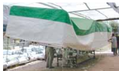
Economic Impact of Module Shape and Tarp Condition

After the ginning season, tarps should be cleaned and dried thoroughly, then inspected. Tarp condition is more important than age. Repair rips and tears and replace damaged straps, ropes, buckles or other fasteners. Only close inspection will reveal pinholes, thinned coatings and the breakdown of UV-light stabilizers—