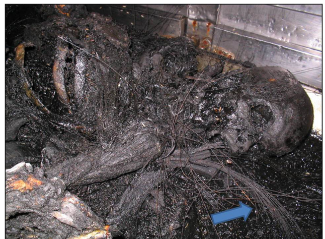
Fig. 4. Charred corpse, anthropological examination revealed that it was a young adult man. Arrow points the tire metal belts.