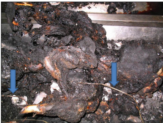
Fig. 3. Cadaver of a young man who was charred inside a pile of tires. Detail of metallic debris from the tires (arrows).