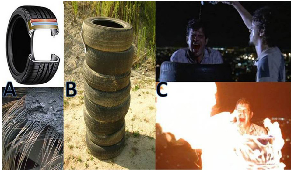
Fig. 1. A. Steel belts inside the tire. B. A pile of tires. C. Very realistic scenes from the movie Elite Squad (“Tropa de Elite”) that reproduces how the victim is positioned inside a pile of tires. The victim is burned alive as a form of torture.