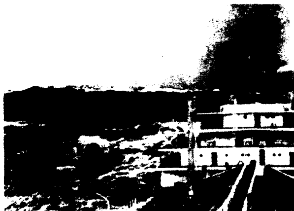
Figure 2. Example of an unusually large long-crested wave.

Given a seaway that is almost invariably short-crested, how do we end up with a single, huge, long-crested wave?