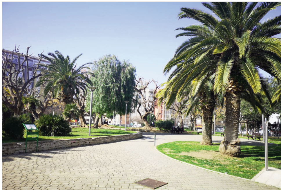
Fig. 4. Partial view of the recreational Parco 2 Giugno.