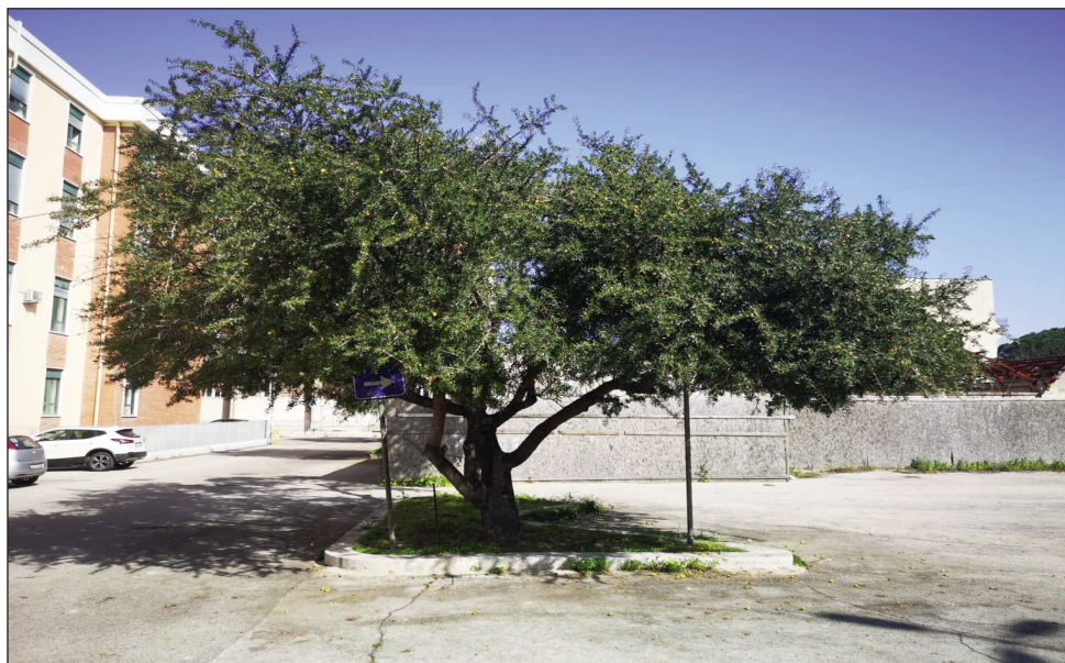
Fig. 5. Argania spinosa cultivated within the Department of Agricultural and Environmental Science of the University.