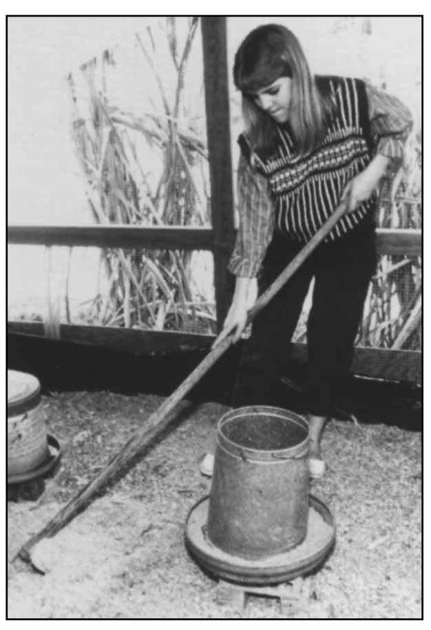
Stir the litter daily to prevent packing. Hard, damp litter will cause breast blisters on the birds.

Optimum performance of the broilers depends on proper nutrition. It is absolutely essential that broilers be fed a high-quality broiler feed containing at least 20 percent protein. Lower-protein feeds, including chick starter, will not do the job. Many experienced feeders start chicks on a higher-protein turkey or gamebird starter to stimulate additional