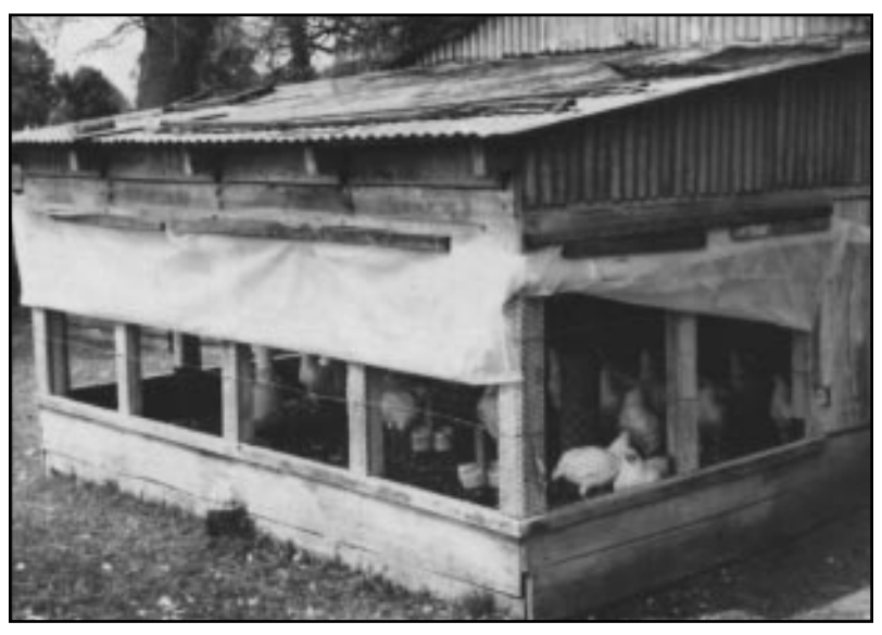
Sheds attached to existing buildings make fine facilities for growing broilers. The openings on three sides of the building provide plenty of fresh air for the birds.

Be prepared for the chicks 2 days in advance. Broilers reared for home use