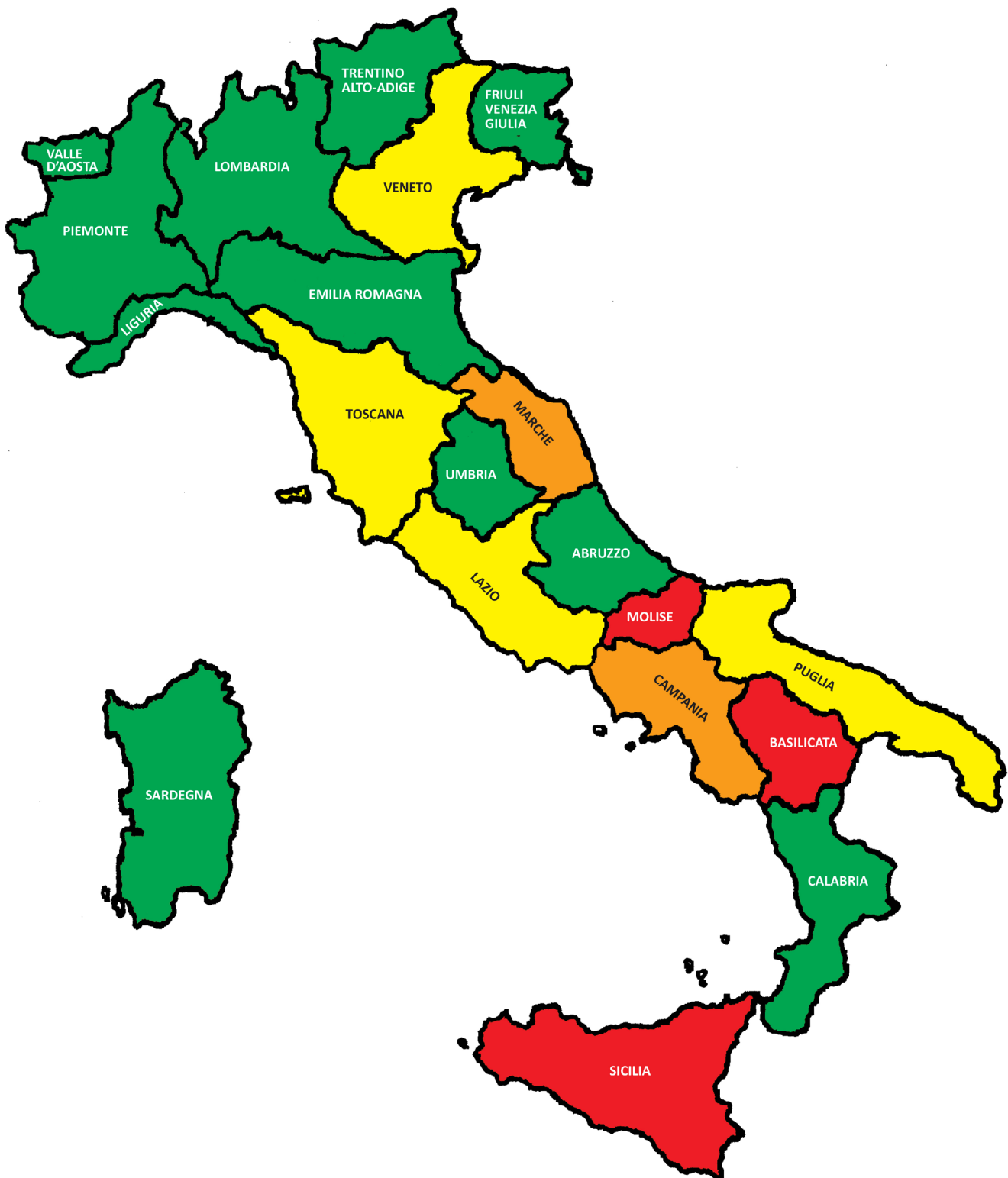
Fig. 2 Extent of the lack of neurointerventionists in Italy

has the risk of becoming meaningless if there is no workforce able to implement those standards.