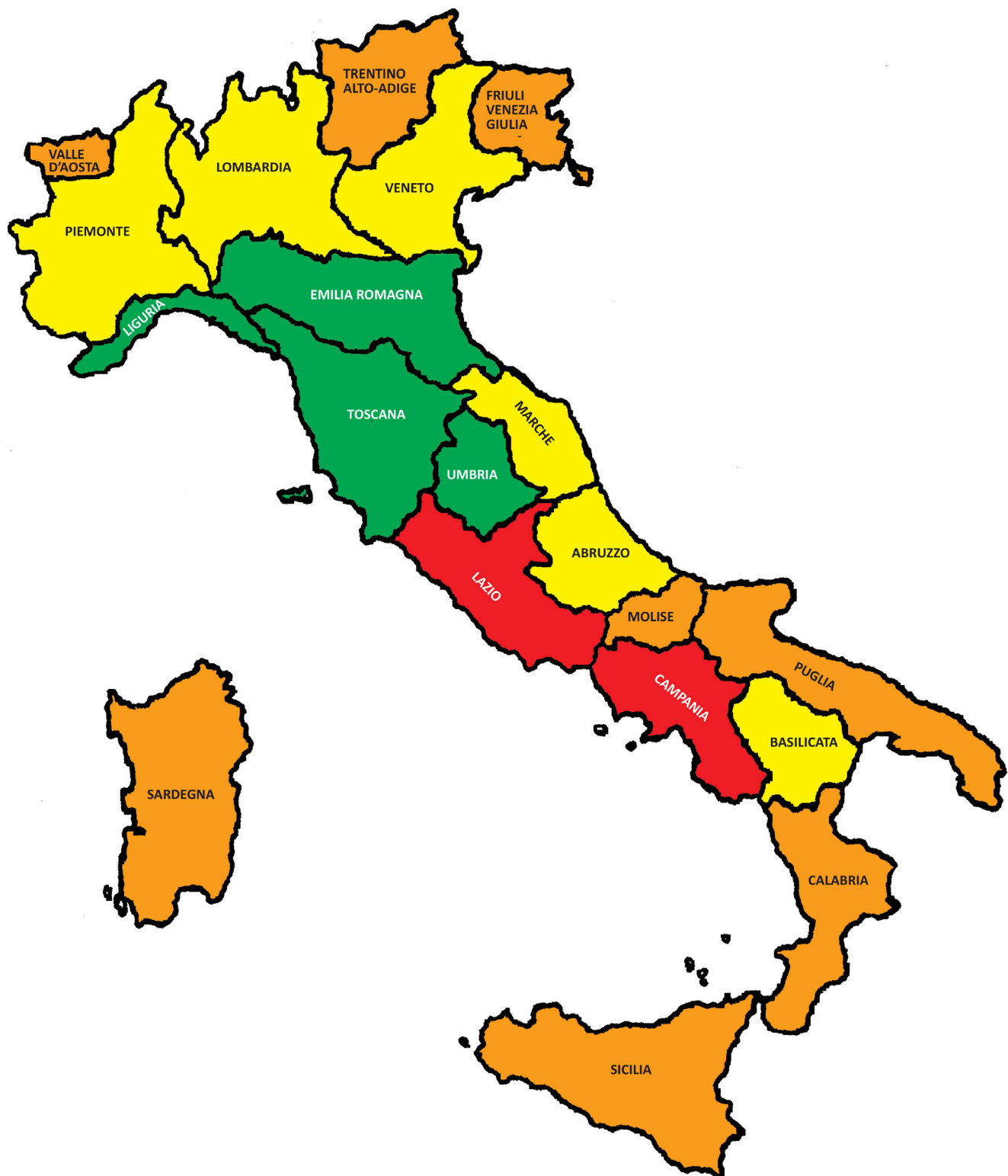
Fig. 1 Extent of the lack of beds dedicated to stroke compared with the expected in Italy

with a profound knowledge on stroke causes, its pathogenic mechanisms, and therapeutic possibilities. He should have extensive clinical skills for facing the complex profile of acute stroke patients and not only the manual ability to recanalize