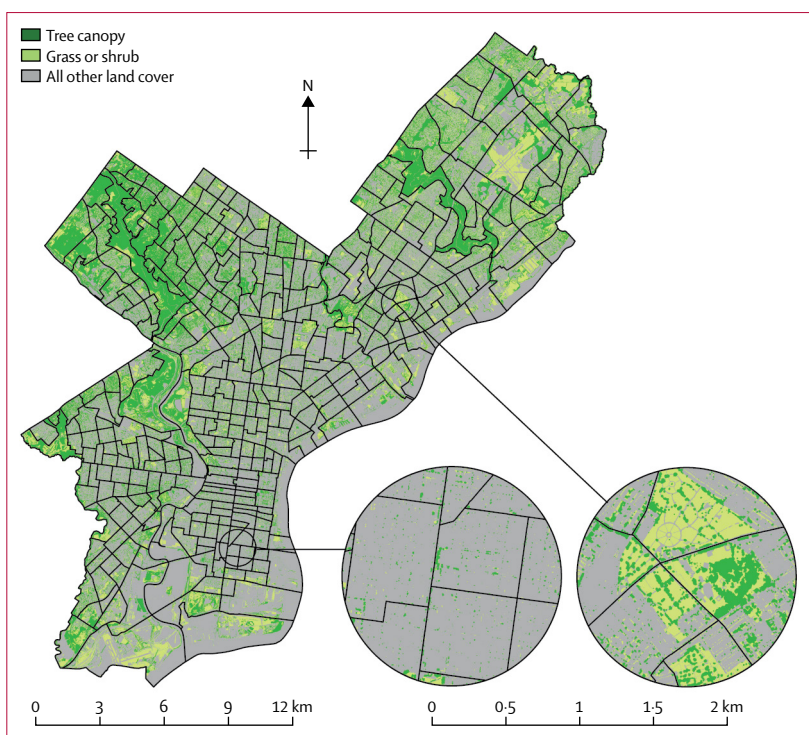
Figure 1: Tree canopy cover in 2014, by census tract

NDVI provides a measure of vegetation density based on the difference between visible red and near-infrared surface reflectance in Land Remote-Sensing Satellite System (Landsat) images. We derived NDVI values from images taken by the US Geological Survey satellite