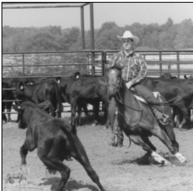
Some performance horses work hard enough to classify the work load as "intense."

High-performance horses , such as cutting horses, reining horses and other athletes, routinely perform both aerobic and anaerobic work while competing in a particular event. Recent research indicates that the performance of such horses can be improved by adding fat to a high-carbohydrate diet . With proper adaptation time, fat supplementation can influence the amount of stored muscle energy in the form of muscle glycogen, which is the fuel supply for anaerobic work.