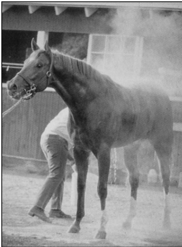
Performance horses lose electrolytes in the sweat. Water, good-quality hay and a well-formulated feed are important in maintaining electrolyte balance.

Some attention should be paid to the potassium requirement of exercising horses, which may be twice the requirement of those at maintenance. When low-quality forages are fed, horses may need potassium supplements. The total ration should contain about 1.2 percent potassium.