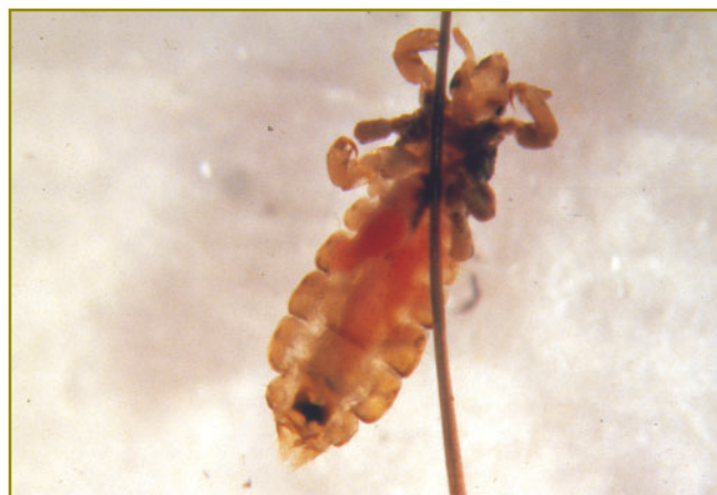
Figure 1. Head louse (body louse looks the same).

Head lice prefer to live on the hair of the head, and are rarely found on other parts of the body. In a severe infestation, secretions produced by lice may cause the hair to become matted. The life cycle has three stages: egg (nit); nymph; and adult. The female lays four to six nits per day or 50 to 150 eggs during her lifetime. Eggs are oval, light tan in color, and about the size of a fine particle of sand. Nits are glued to the base of hair shafts near the scalp,