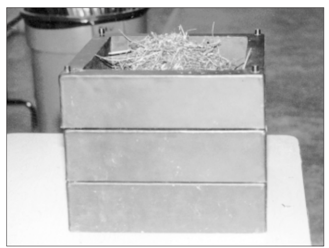
A separator is simple to use and can be used on-farm to monitor changes in forage harvesting procedures or feed mixing protocols.

monitor changes in forage harvesting procedures or feed mixing protocols. This tool separates particles into three groups: particles greater than 0.75 inches, between 0.31 and 0.75 inches, and less than 0.31 inches. The upper screen identifies particles that will be