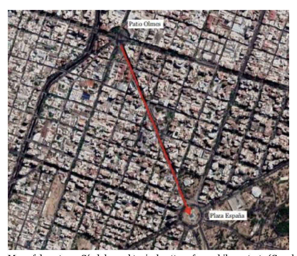
Figure 4 - Map of downtown Córdoba and typical pattern for mobile protests (Google Maps 2021)

Early protests following the imposition the lockdown set the tone for the emergence of a new facet of Argentine protest culture related to public health protocol subversion, albeit gradually at first. These movements theoretically adhered to protocols for COVID-19 by taking place in cars; however, even this undermined core government tenants as citizens were prohibited from leaving their homes except to purchase basic necessities. Though adhering to some public health measures, the protests also communicated the sentiment of overruling government decisions, adding a level of credibility to the cause by subtly risking a pandemic to demonstrate on behalf of the issue. Without traffic to obstruct, caravans of protestors drove slowly up main avenues, honking, playing loud music, and disrupting the otherwise quiet city. Vehicles' signs, flags, and symbolism communicated support for causes ranging from union complaints to free public education to issue-based protests like objection to national judicial reforms. However, these protests lacked the presence and engagement of traditional demonstrations based on a culture of large-scale disruption.