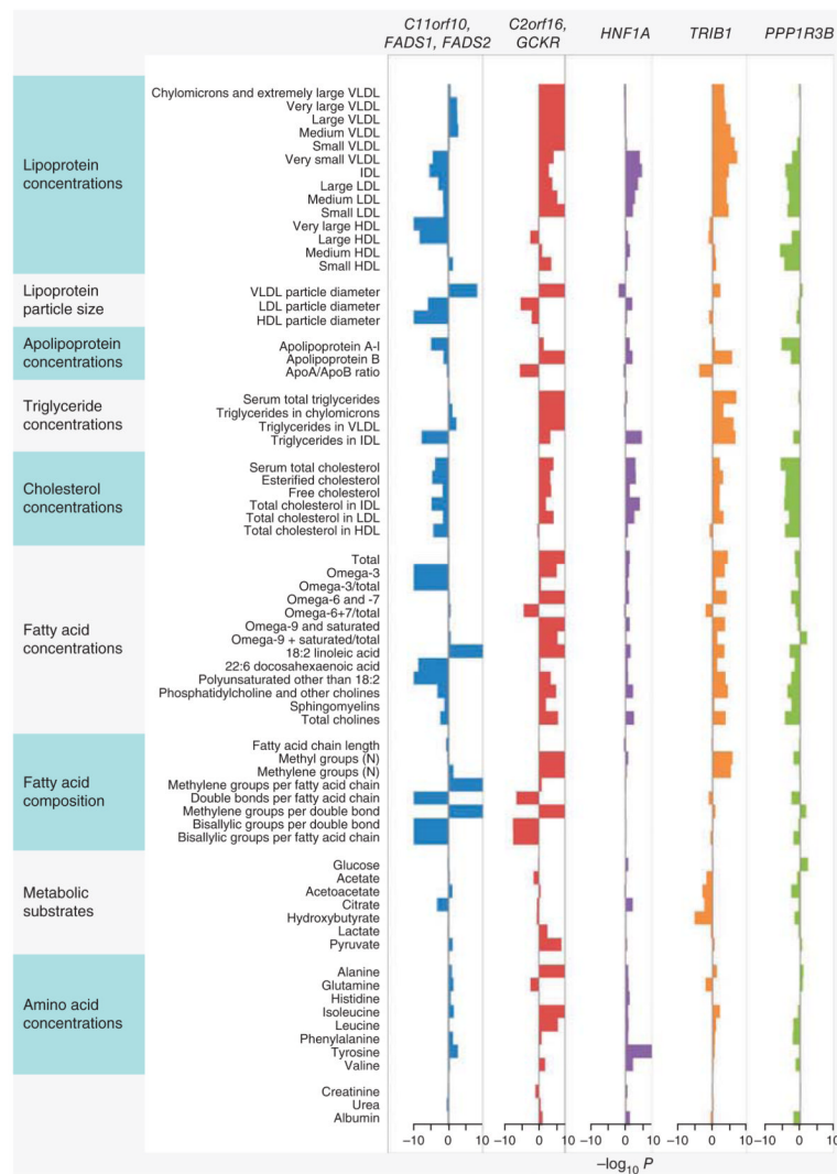
Figure 3. Association of FADS1 , FADS2 , GCKR , HNF1A , TRIB1 and PPP1R3B loci with NMR metabolome. Bars are for -\log_{10} P value, signed for direction of effect.