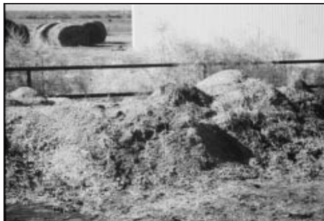
This stockpile of horse manure, straw and wood shavings is unsightly and, if uncontrolled, can pose a threat to water quality in nearby streams and ponds.