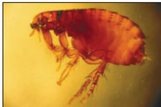
Cat fleas are the most common fleas on dogs and cats. They also infest raccoons, opossums and coyotes.

Cat fleas do not normally live on humans, but do bite people who handle infested animals. Flea bites