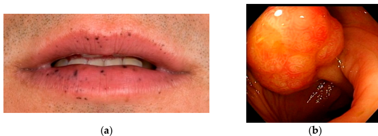
Figure 1. Pigmentations (a) [6] and polyp (b) characteristic for Peutz–Jeghers syndrome.

Peutz–Jeghers syndrome (PJS) is a rare hereditary condition characterized by mucocutaneous pigmentation and Peutz–Jeghers hamartomatous polyps, predominantly affecting the small intestine (Figure 1) [1,2]. The diagnostic clinical criteria for Peutz–Jeghers syndrome are shown in Table 1 [3–5]. In childhood, symptoms are mostly caused by polyp-related complications, including bleeding, anaemia, and obstructive symptoms. Small bowel intussusception is the most urgent and even life-threatening manifestation. In adulthood, PJS patients face an increased risk of a constellation of different cancers.