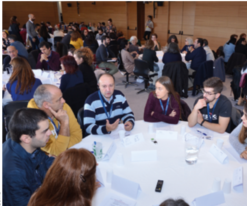
Figure 4. Discussion tables in the CONCISE consultation in Lisbon. The tables were heterogeneous in terms of gender and age, to create a more lively and diversified discussion.

The CONCISE team has already produced two kinds of dissemination materials about the process of