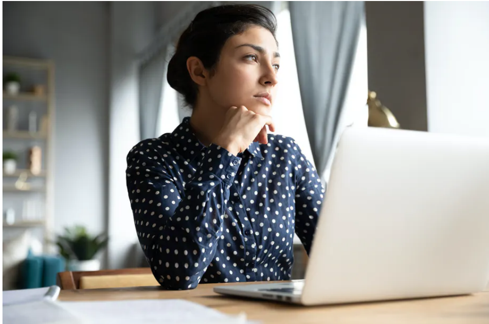
Tired and distracted.