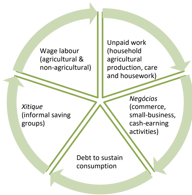
Figure 1: Interdependence of wage and reproductive work through money flows