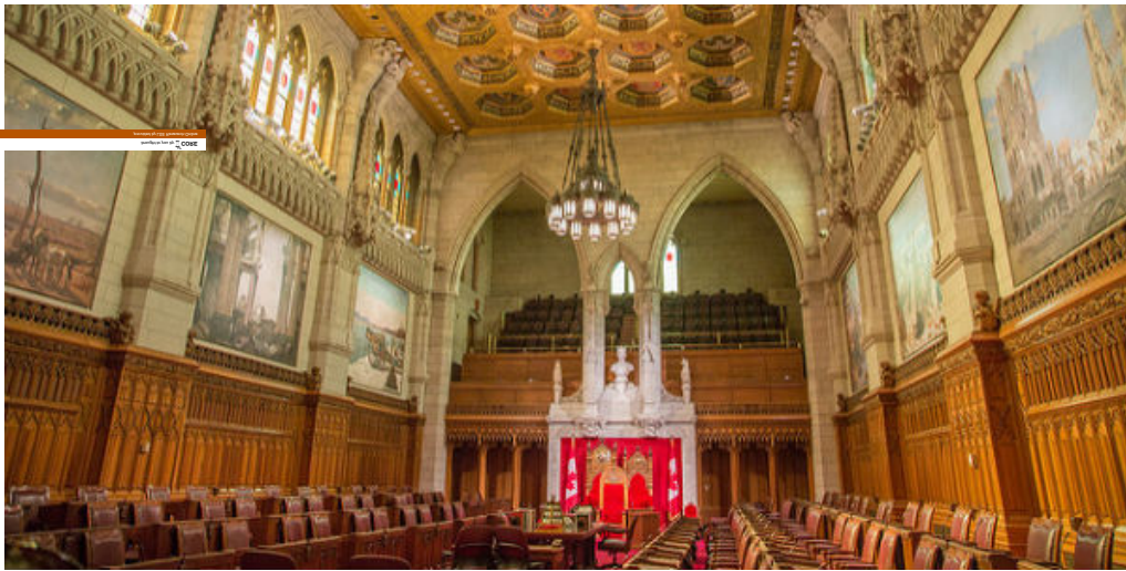
The Senate chamber, Houses of Parliament, Canada.