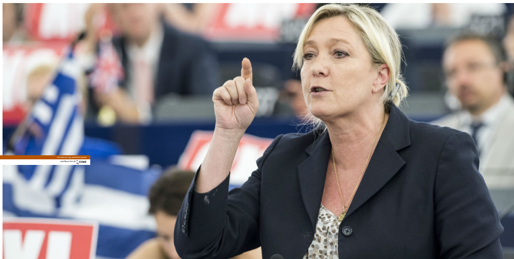
Marine Le Pen in the European Parliament.

With the growth of insurgent political parties that challenge the status quo, scholars are presented with a dilemma about how to categorise them. Takis S Pappas argues that nativist and populist parties are two distinct categories, and offers a set of criteria for classification.