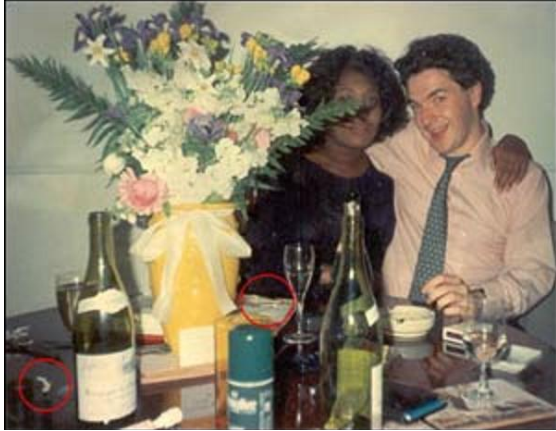
What is highlighted is the suspected cocaine.