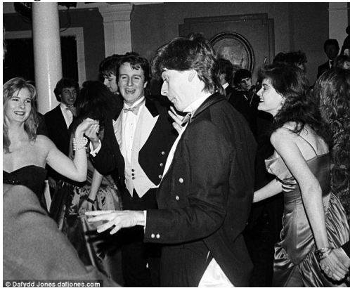
An image of a social, it is a Bullingdon event proven by the distinct uniform.