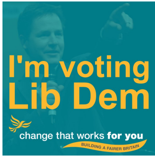
(Pack, April 25, 2010)