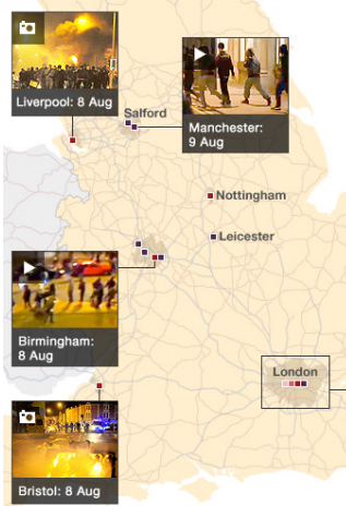
( http://www.bbc.co.uk/news/uk-14436499 )

Riots and disorder spread across England