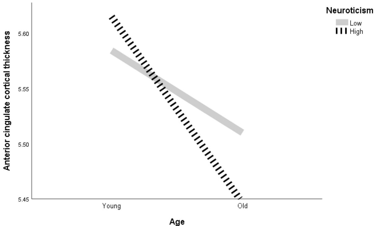
Fig. 1. (a) Interaction among neuroticism, gender, and age in males, (b) Interaction among neuroticism, gender, and age in females.

having one of the largest differences in thicknesses between genders (Luders et al., 2006; Sowell et al., 2006). This pre-existing difference in cortical thickness could impact the magnitude and direction of CT across age.