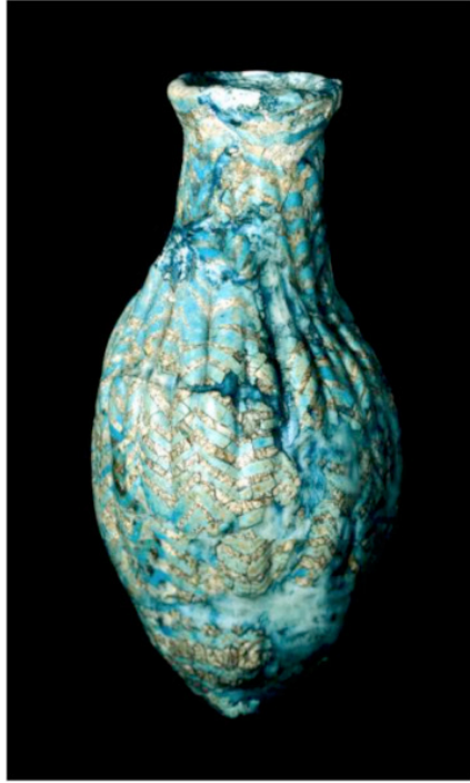
Kassite, core-formed, glass vessel showing weathering. Ur, 1200-1300 BCE, British Museum 120659. ( https://www.britishmuseum.org/collection/object/W_1928-1009-147)

Where glass was first made is not clear – it appears in the archaeological record in quantity in both Egypt and the Near East simultaneously, as far as we can tell. Identified glassmaking sites of this period are very rare, indeed none have been conclusively identified in the Near East at all, although limited finds indicating glassworking are present. There are three that are reasonably well known in Egypt, the earliest of which is probably connected with the Palace of Amenhotep III (1338-1351 BCE) at Malkata, near Thebes, now Luxor.