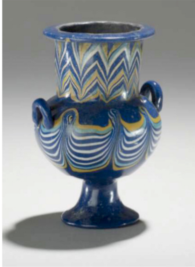
Extremely well-preserved, core-formed, glass vessel from Memphis, Egypt. 1393-1352 BCE, British Museum, EA4741. ( https://www.britishmuseum.org/collection/object/Y_EA4741)

Before this time, vessels were “core-formed”. This is a rather laborious technique where a core of dung and clay is dipped into molten glass to completely cover it, and then decorated by trailing rods of contrasting colors across the body and adding handles, rims and feet, if desired (see the Corning Museum of Glass website for some excellent videos showing this technique being performed ). On cooling, the core has to be carefully chipped out to create the vessel. These vessels are strikingly colored when well preserved, with an aesthetic that is still appealing now.