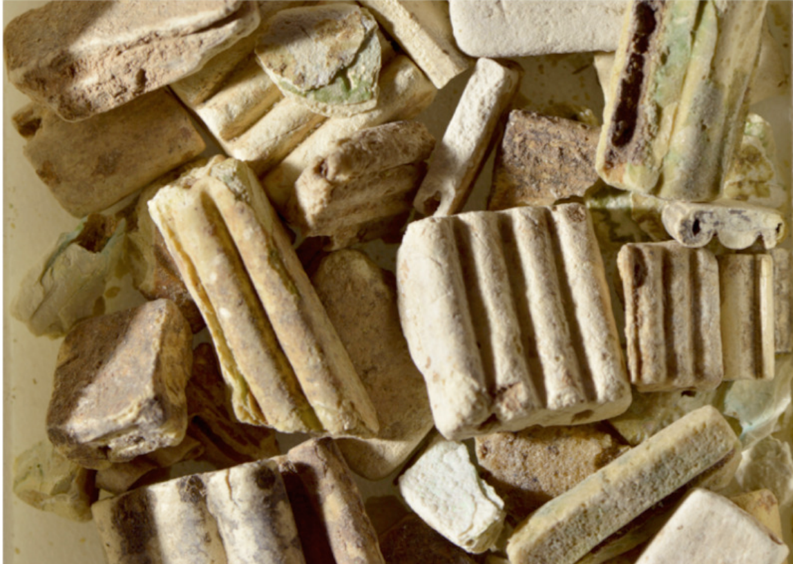
Weathering patterns on vitreous materials. Here spacer beads from the City of Nuzi are weathered by water to make them white and very delicate. They would almost certainly all have been a brilliant blue colour. From Harvard Museum of the Ancient Near East.

It is clear that the Near East did produce glass locally, and the evidence for this is derived from the analysis of the glass found in the Near East and in Egypt. Several techniques have been used in the past, but perhaps the best technique being used now is Laser Ablation Inductively Coupled Mass Spectrometry. LA-ICPMS uses a high-power laser to remove a very small sample from the glass object (typically only 0.1mm across, invisible to the naked eye). This sample is ionised in a plasma torch and then the ions of each of the elements it contains are counted by the mass spectrometer. The technique has the advantages of being able to analyse almost all the elements that are found in glass, plus it has very low detection limits – for many elements it can quantify down to one part in a billion – outstanding performance and very useful.