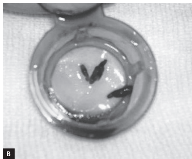
Figure 2. A. Thrombus from first passage; B. Thrombus, final

dings (lack of evidence of atherosclerotic lesions), a diagnosis of embolic origin of the infarction was made, and the procedure was stopped at this point.