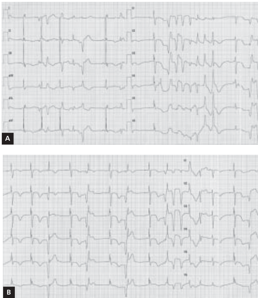
Figure 1A, B. Paced rhythm 70 bpm, with QTc prolongation to 666 ms, polymorphic ventricular extrasystoles with several short runs of torsade de pointes ventricular tachycardia