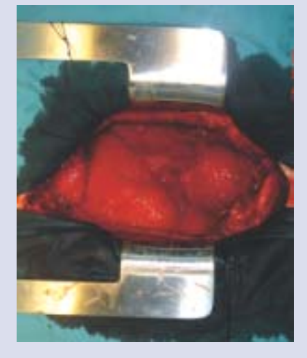
Figure 3. Surgical specimen of the large pericardial cyst