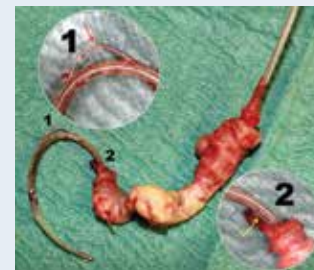
Figure 4. Magnification of lead wire externalisation in frames (1, 2)