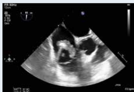
Figure 1. Transoesophageal echocardiography examination — vegetation on the lead in the right atrium and the right ventricle with length approximately 71 mm

A 48-year-old patient, after implantation of a VDD pacemaker 10 years ago and after pacemaker replacement 6 months ago, was repeatedly hospitalised for the last 4 months for recurrent upper respiratory infections and exercise tolerance deterioration with a decrease in body weight of 10 kg and increased inflammatory parameters: C-reactive protein 70.82 mg/L (< 5 mg/L), white blood cells 21.87 \times 10^3(1/\mu\text{L}) , D-dimer 6461 \mu\text{g/L} (< 500 \mu\text{g/L} ). The patient was diagnosed with bronchitis and sinusitis. Other complaints were explained as neurosis. Correct diagnosis was made after angio-computed tomography examination — where septic pulmonary embolism of the arteries of the lower lobes was revealed. These were followed by transthoracic and transoesophageal echocardiography, which confirmed the presence of vegetation associated with the endocardial lead. In multiple positive blood cultures growth of Staphylococcus capitis was found, and targeted antibiotic therapy was implemented. On the basis of the modified Duke criteria for endocarditis, a diagnosis of lead-dependent infective endocarditis was made, and the patient was qualified for pacemaker system removal. In chest X-ray an excess of VDD lead in the right heart cavities was shown and the externalisation of wires in the distal portion of the lead was suspected. Due to the large size of the vegetation (the length: 71 mm) connected to the lead and its coarse