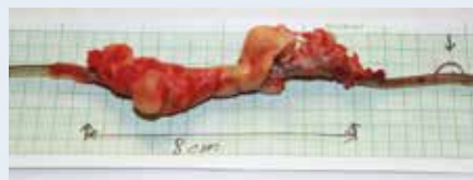
Figure 2. View of the operating field — VDD pacing lead with visible vegetation (arrows)

texture (Fig. 1), the patient was qualified for complete system removal during cardiac surgery with cardiopulmonary bypass. During the procedure, the lead was removed completely with the total mass of the vegetation (Figs. 2, 3). Also, externalisation of two internal cables was confirmed (Fig. 4). Further course of hospitalisation was uneventful. Reimplantation of the pacemaker was postponed. In conclusion, the presented VDD lead externalisation has not been described so far in literature. Due to the different structure of VDD leads, in relation to the classical pacing leads and the defibrillation leads, there were no analyses on this subject in the literature dealing with the phenomenon of wire externalisation.