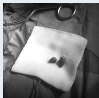
Figure 2. The embolism removed during carotid endarterectomy