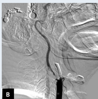
Figure 1. Left internal carotid artery before (A) and after (B) intra-arterial thrombolysis