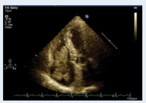
Figure 1. Apical four-chamber two-dimensional echocardiogram of a right atrial myxoma — diastole