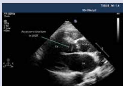
Figure 4. TTE, parasternal long axis view