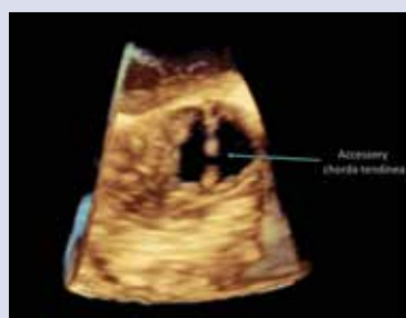
Figure 5. 3D TEE, view from the left ventricle