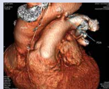
Figure 3. CT, image reconstruction