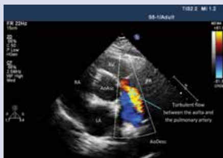
Figure 1. TTE, Doppler echocardiography