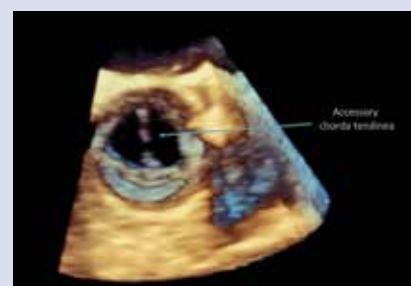
Figure 6. 3D TEE, view from the ascending aorta