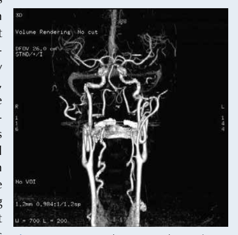
Figure 2. Computed tomography angiography excluded dissection of tight kinking of both internal carotid arteries and tortuous vertebral arteries