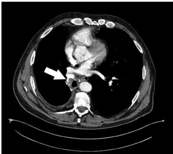
Figure 1. Contrast-enhanced computed tomography of the chest showing right lower lobar pulmonary thrombosis (arrow)