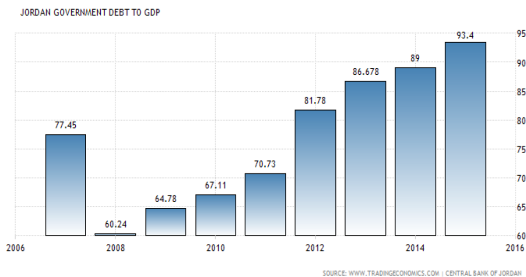
Figure 1. Jordan government debt to GDP 2007-2015