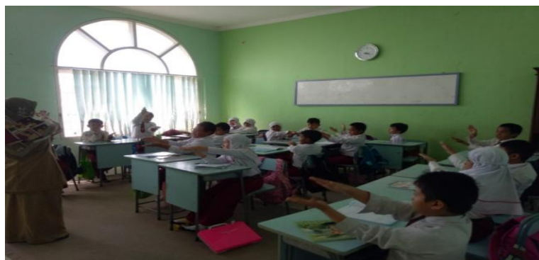
Figure 5. Implementation of Evaluation