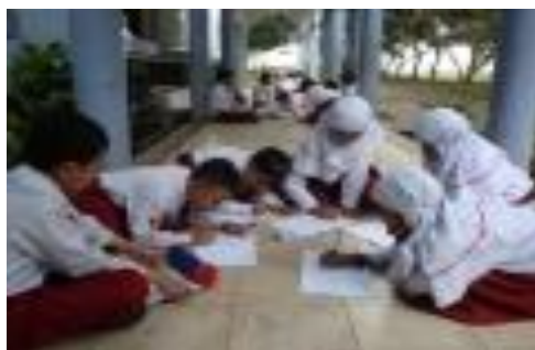
Figure 4. Portofolio Evaluation Implementation

play a role in the difficulties faced by friends. With that, students get the opportunity to collaborate indirectly. Through collaboration, the demands of students in the 21st century are expected to be met through interactions in the Arabic learning evaluation system. 28