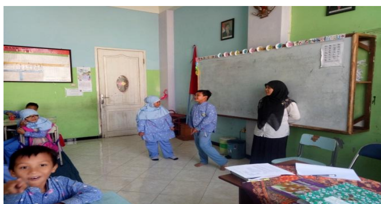
Figure 6. Implementation of Evaluation Process

Through figure 5 and 6, the assessment process for the cognitive aspects of students is in the form of song creation; while the psychomotor assessment of how students express words, sentences that are arranged properly and correctly. Students can change the structure of Arabic sentences using the situations and conditions they have. Each theme that is studied has a different song instrument. This avoids student boredom so that later they can increase their creativity in composing the song.