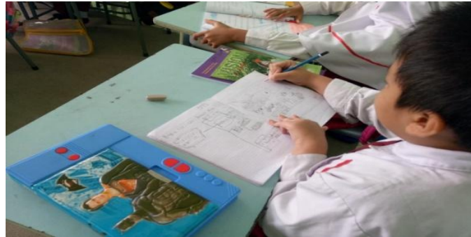
Figure 3. Portfolio technique

The portfolio development technique is based on Figure 3 through the following steps; the teacher explains to students about the concept of the portfolio that contains their work; the teacher provides a sample portfolio in the form of a mind mapping on the teaching material that has been obtained; the teacher collects the work and evaluates it according to the creativity of the students in developing mind mapping; after the work is assessed and if it is not satisfactory, students can improve it.