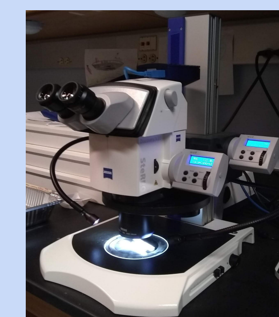
Figure 3. Stereomicroscope

Examination and imaging of sample slides were by the ZEISS SteREO Discovery.V20™ microscope. The objective lens applied for all images was the Achromat S 1.5x FWD 28mm. For optimal imagery, a z-stack was conducted based on the topography of each hemp fiber. Additionally, images underwent further processing methods such as "Extended View of Focus" to sharpen resolution, or "White Balance" to adjust light reflection or both. Displayed images demonstrate two fields of vision of each hemp sample, a half and zoomed view. Optimal images for each sample are presented.