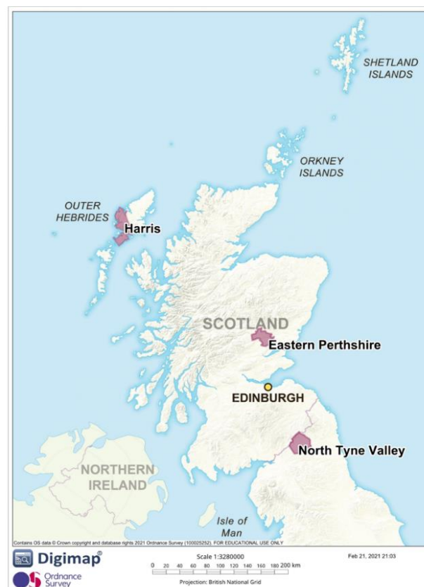
FIGURE 1: CASE STUDY LOCATIONS

Research was carried out between October 2019 and September 2020, both before and during the Covid-19 pandemic and lockdowns.