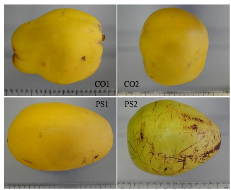
Figure 1 Variability in the shape of fruits quince ( Cydonia oblonga Mill., CO1 – var. pyriformis , CO2 – var. maliformis ) and Chinese quince ( Pseudocydonia sinensis Schneid., PS1 – var. ellipsoidea , PS2 – var. ovoidea ); (Photography: A. Monka, 2013).

Klimenko , (1993) found in a study of the quinces elongate average weight in the range of 40.00 to 234 grams. In some varieties determine the weight of 300 g (Portugalska) to 2 kg (Berecki). Salaš , (2001) determine the weight of the fruit depending on variety from 100 to 1200 g. Comparing our results with those of these authors, we found some consistency. It is common knowledge that the morphological features of the variety are specific and related to the shape of the fruits.