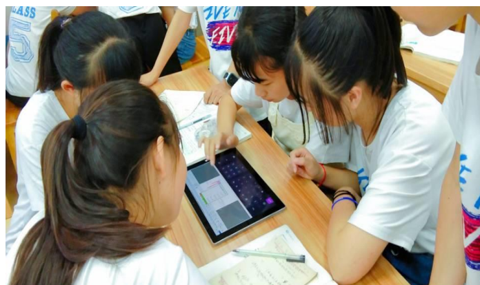
Figure 3. Student Team Work Use Tablet to Explore

Teacher : Yes. Excellent, very accurate explanation. But if we observe through the scatter plot every time it is not only troublesome but also inaccurate, do you have any good ideas to solve this problem?